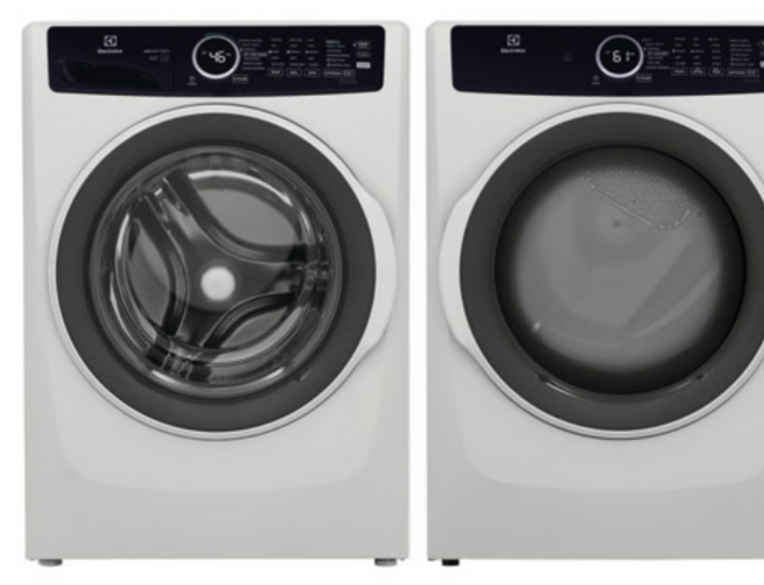
Electrolux Front Load -Washer and Dryer Combo (ELFW7437AW, ELFE743CAW)