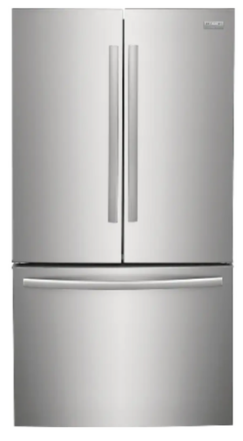
Frigidaire Fridge (grfg2353af)