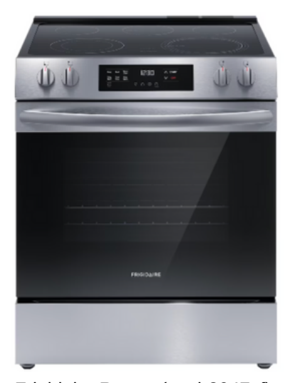
Frigidaire Range (cgeh3047vf)