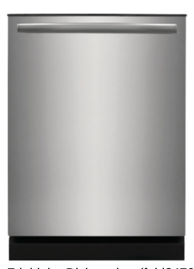
Frigidaire Dishwasher (fgid2476sf)